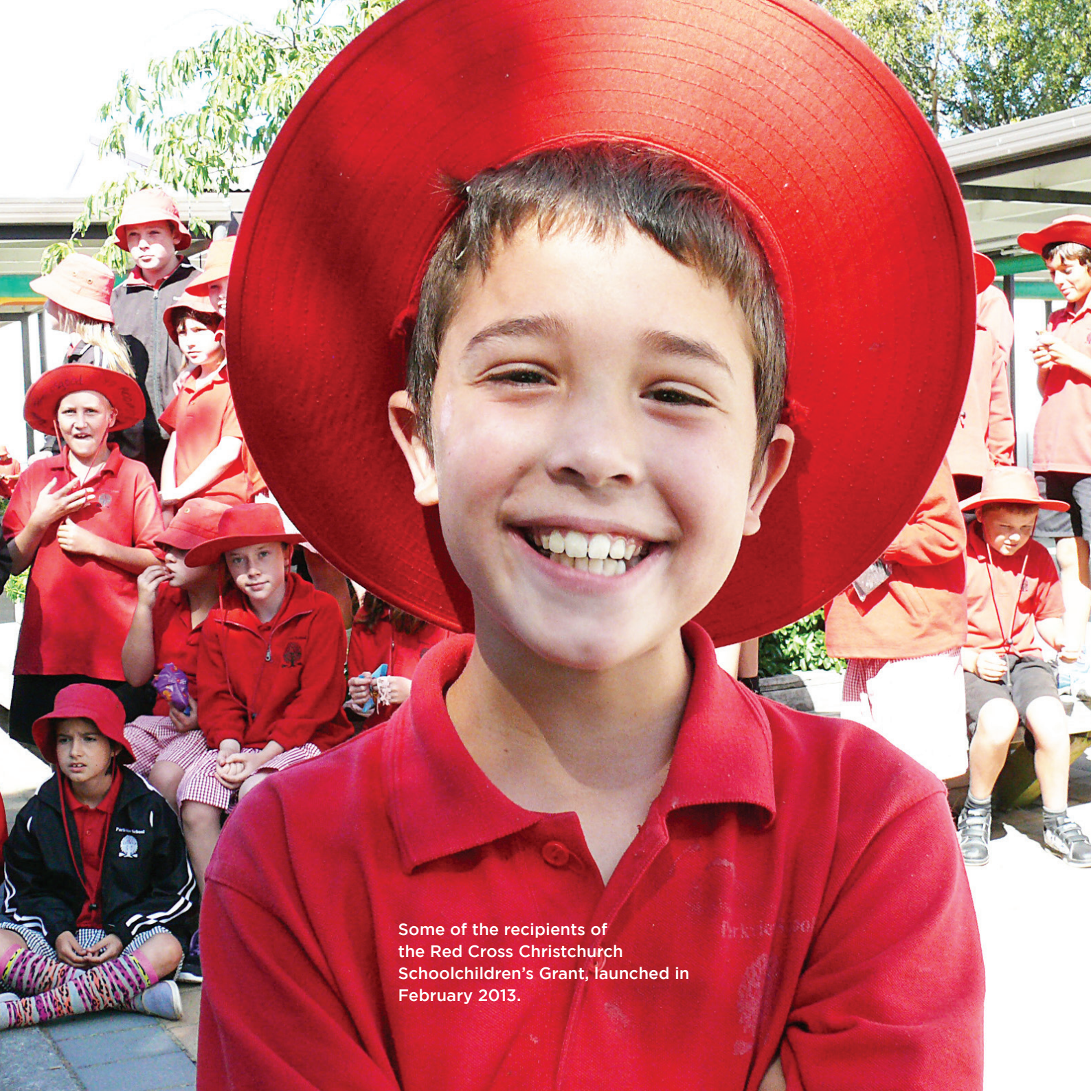
Some of the recipients of the Red Cross Christchurch Schoolchildren's Grant, launched in February 2013.