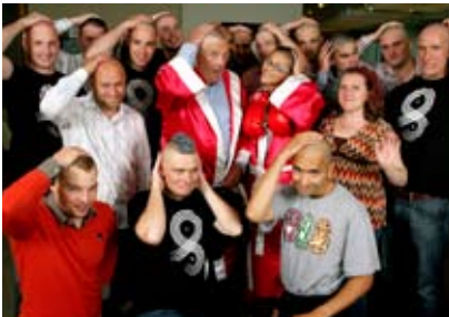
SHAVE FOR A CURE PARTICIPANTS